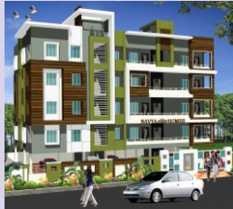
NAVYA ELITE HOME (Kondapur)