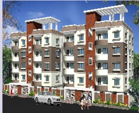
NAVYA NIVAS (Kondapur)