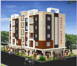
NAVYA SQUARE (Nagole)