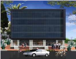
NAVYA VAZEER ESTATE (Chinthalkunta)