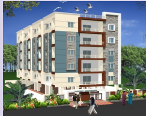
NAVYA MEADOWS (Vijaywada)