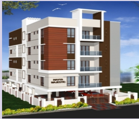
NAVYA MAJESTIC (Kondapur)