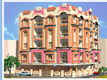
ROSE RESIDENCY at Mehidipatnam, Hyd. - 60.