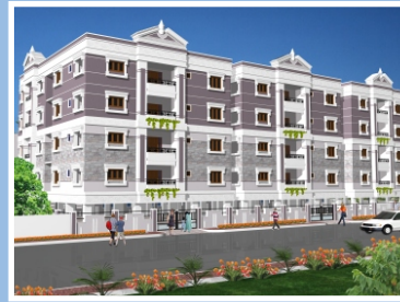
NAVYA PRIDE at Manikonda, Hyderabad.