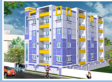
NAVYA ENCLAVE - I at Pragathinagar, Kukatpally, Hyd.