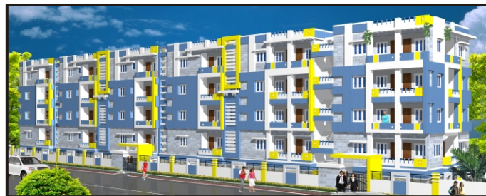
NAVYA ENCLAVE - II & III at Pragathinagar, Kukatpally, Hyd.