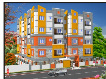
NAVYA ORCHIDS at Secretariat Colony, Puppalaguda, Hyd.