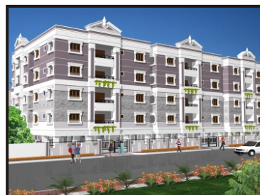
NAVYA PRIDE at Manikonda, Hyderabad.