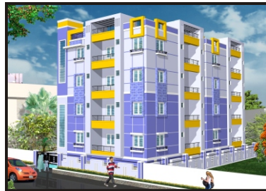
NAVYA ENCLAVE - I at Pragathinagar, Kukatpally, Hyd.